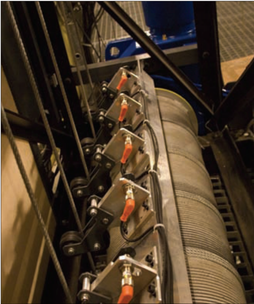
New slack wire detection was installed to increase safety.

converting industries, primarily plastics, steel, paper, wire and cable, cranes, printing and countless other traditional industries.”