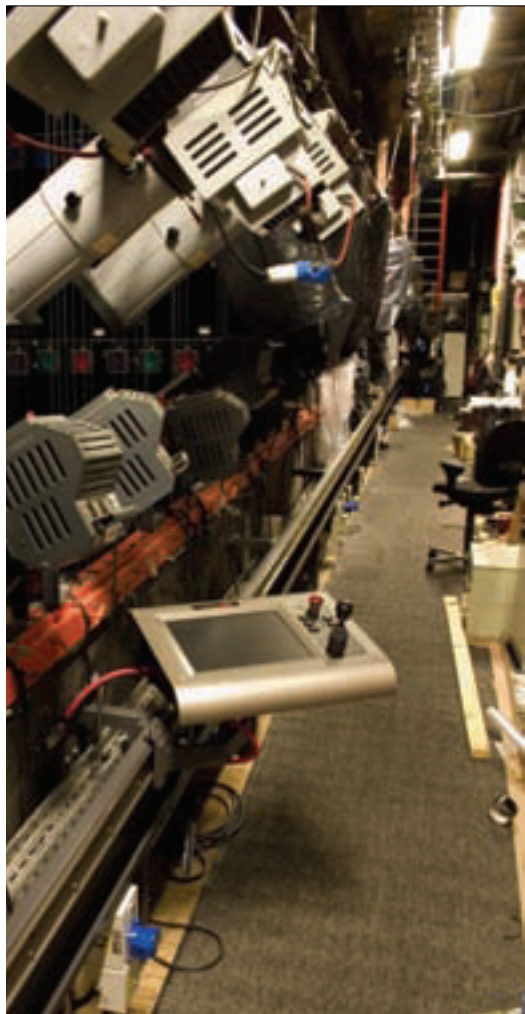
Visual Act's Touring Desk control panel is one of four portable control desks.

The Royal Danish Theatre has occupied the heart of Copenhagen for centuries and recently upgraded to a new control system featuring Sprint Electric DC drives to extend the lives of the existing motors, keeping replacement costs down. The Swedish stage design and technology company Visual Act retained most of the original motors and mechanics while providing a much-needed facelift to the stage.