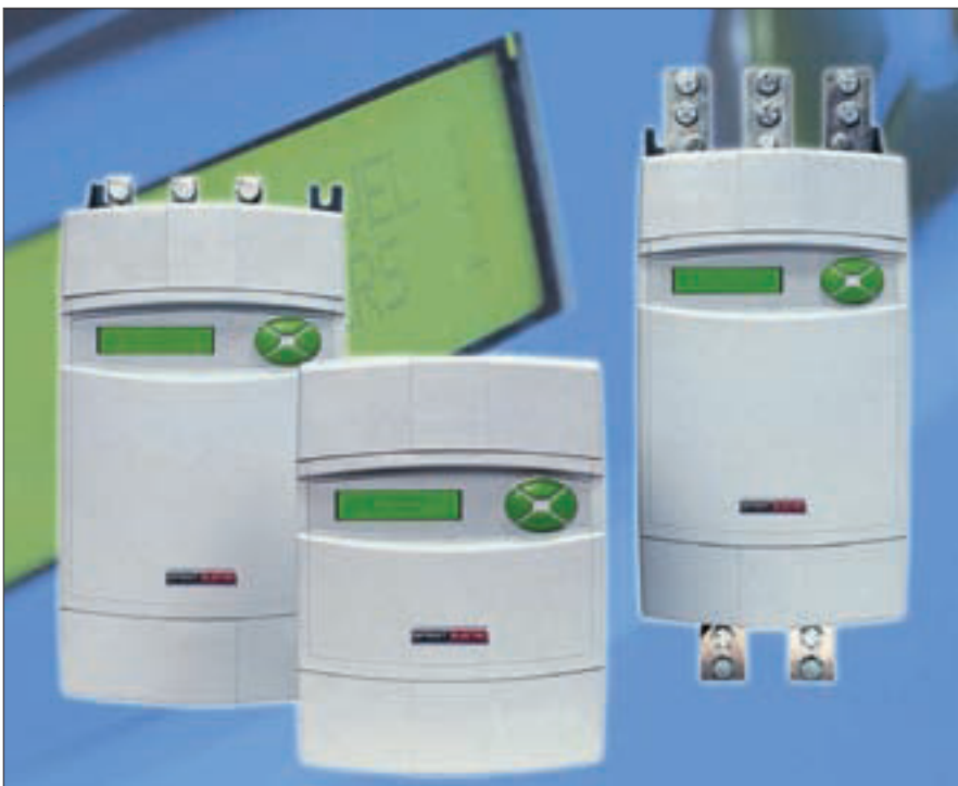
The PLX drives come in two- and four- quadrant models, and they’re designed to be powerful, flexible and easy to program.

Visual Act Värmdövägen 703 SE-132 35 Saltsjö-Boo Sweden Phone: +46 8 747 15 70 Fax: +46 8 747 14 50 www.visualact.net