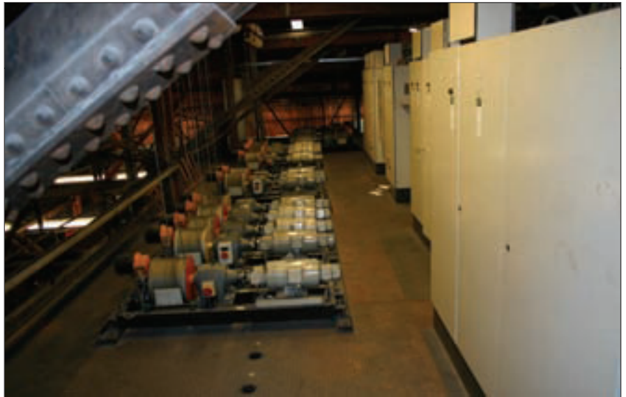
A total of 39 Sprint Electric DC drives were installed to extend the lives of the theatre's existing motors.